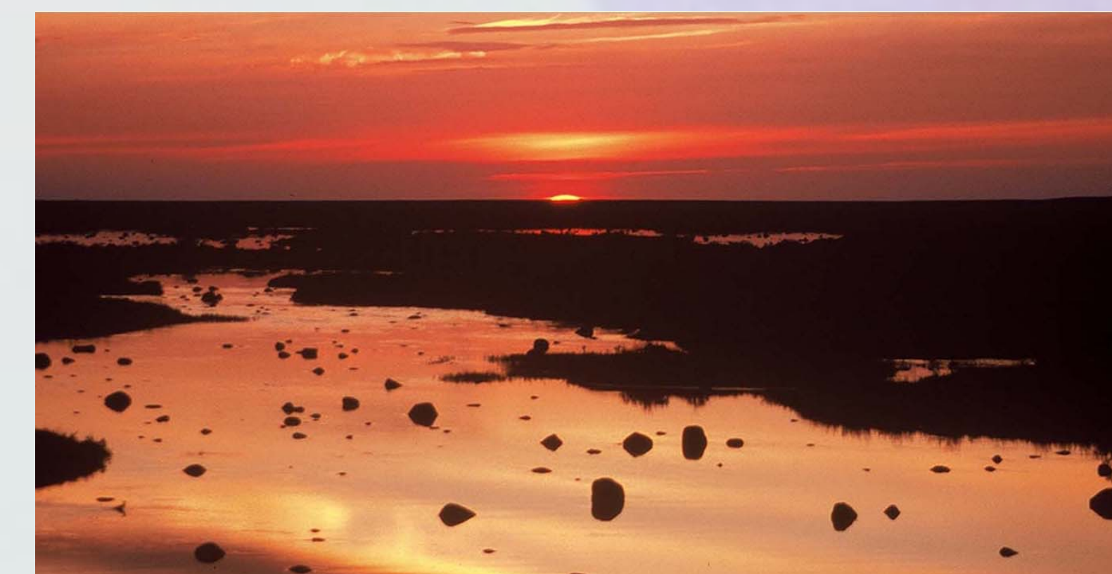
Nunavut's coast in Canada's Arctic.