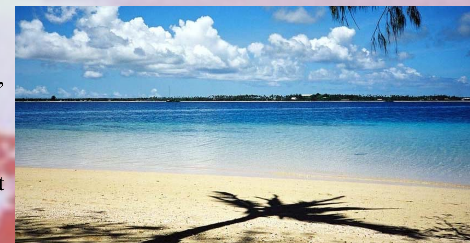
Pangaimotu Island in Tonga, a SIDS.