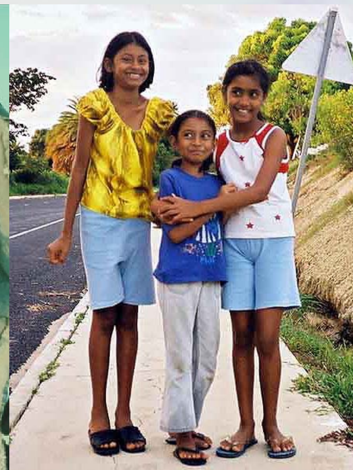
Arctic and SIDS peoples are Many Strong Voices' main partners.