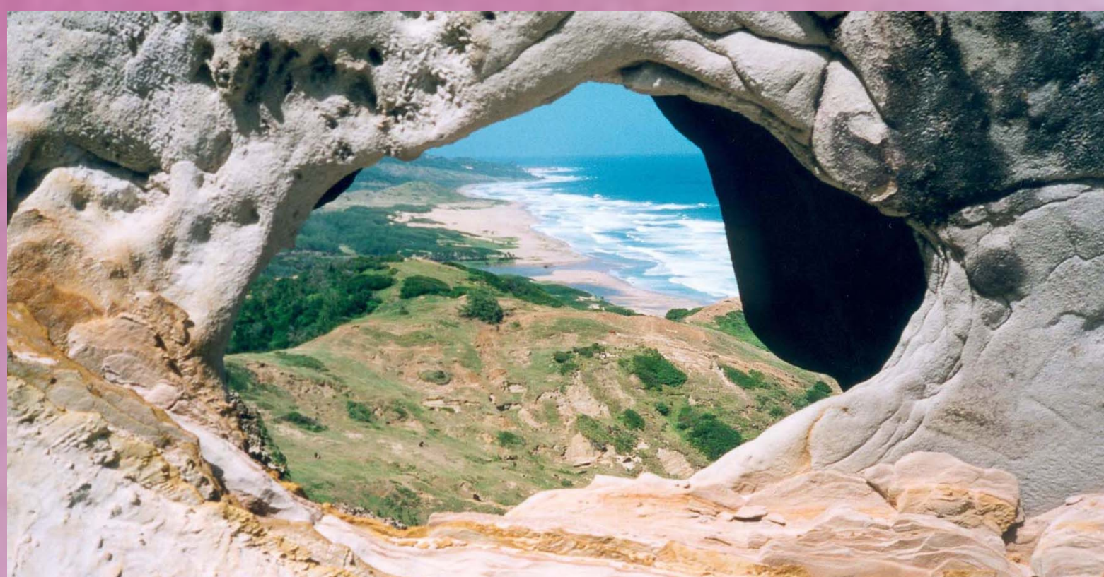
Chalky Mount in Barbados, a SIDS.